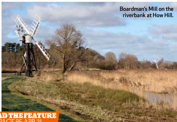
Boardman's Mill on the riverbank at How Hill.