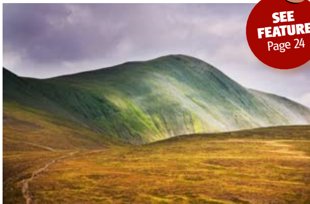
Skiddaw Little Man seen from the path across Carl Side.

A fantastic first climb to introduce someone special to the Lakeland heights, but also a sublime way for anyone to explore England's fourth highest mountain. The route rises through the slopes of Dodd Wood to climb Ullock Pike and follow a gentle flank leading on to Skiddaw itself. A steep climb to the summit is rewarded by some of the best views in the Lake District and the gentle descent through the woods is a gem.