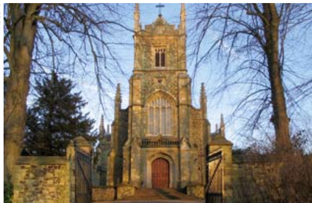
The now disused Catholic Apostolic church near the start of your walk.

In the peaceful Tillingbourne Valley, there stands a fine 19th-century Catholic Apostolic church, built by Henry Drummond, owner of Albury Park Estate. In 1840, it became the spiritual centre for a body of Christians, whose fervent conviction was that the 'second coming' was imminent. When the last minister died, the church closed its doors to the public for the last time.