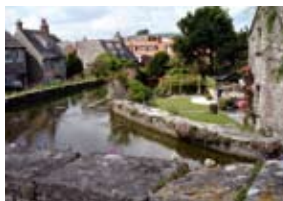
Swanage Millpond – see Point 1.

At coastal watch lookout, swing L and continue along water's edge into Swanage. When you have swung R along promenade you will eventually reach a jetty – this is opposite Victoria Avenue which will take you to car park.