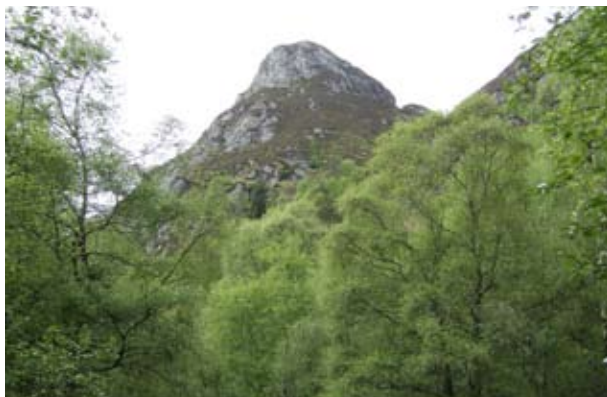
A view of Ben A'an between Points 2 and 3 of the walk.

Don't be fooled by the 'easy' grade and short distance of this up-and-down-the-same-way route. Ben A'an is a Munro in miniature, having all the attributes of a mountain twice the height of its 454m (1,491ft) summit. And don't be worried by returning the same way. This is a route that seems completely different in reverse and besides, there is no other way down, and you can finish off with a steamer ride on wonderful Loch Katrine! As a reward for your efforts you will get a view from the distinct rocky summit that is one of the best in the Highlands. Make sure you keep an eye on the kids – there are crags around the summit. By Steve Goodier.