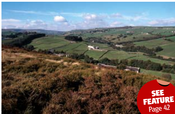
Looking down over the Worth Valley from Penistone Hill.