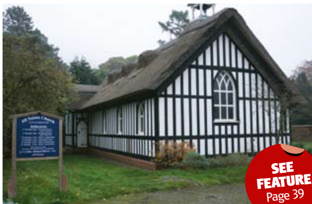
Visit the quaint All Saints Church at Little Stretton.

Could this be Britain's best geocache trail? The walking is stunning and the content of the caches is totally compelling: a series of three amazing tales highlighting the wartime heritage of the Long Mynd. From munitions calamities to the battle training of peregrine falcons, this is a terrific story which unfolds as you walk. As if that wasn't enough, there's the first-ever Country Walking geocache to find, too – with a few surprises of its own. * Note: To locate the four geocaches (and get clues if you need them), you will need to be registered at www.geocaching.com . See feature for details. By Nick Hallissey.