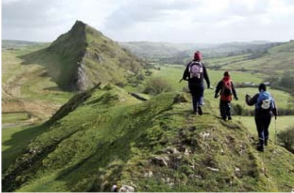
Climb to the summit of Chrome Hill at Point 3.

The wonderful limestone peaks of Chrome and Parkhouse Hill are two of the steepest and narrowest ridge walks to be found anywhere in the Peaks. This route takes in both tops in a demanding round on steep and often narrow, exposed ground.