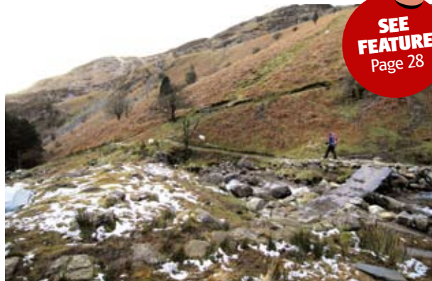
Heading back down towards Minffordd near the end of the walk.

Cadair Idris is Wales' most popular peak after Snowdon – and this walk will show you why. The Pony Path from Ty-nant is the easiest ascent, but try this cracking route from the other side – it's worth the extra effort. Head up to the rock-cradled Llyn Cau and then round the rollercoaster ridgeline above. The going can be steep and rocky – but nothing too airy – and the views are quite simply awesome, taking in the Long Mynd of Shropshire, Snowdon, the Rhinogs, Plynlimon, the Llyn Peninsula and over the sea to Ireland (on a really, really good day). It's magic. Pure and simple.